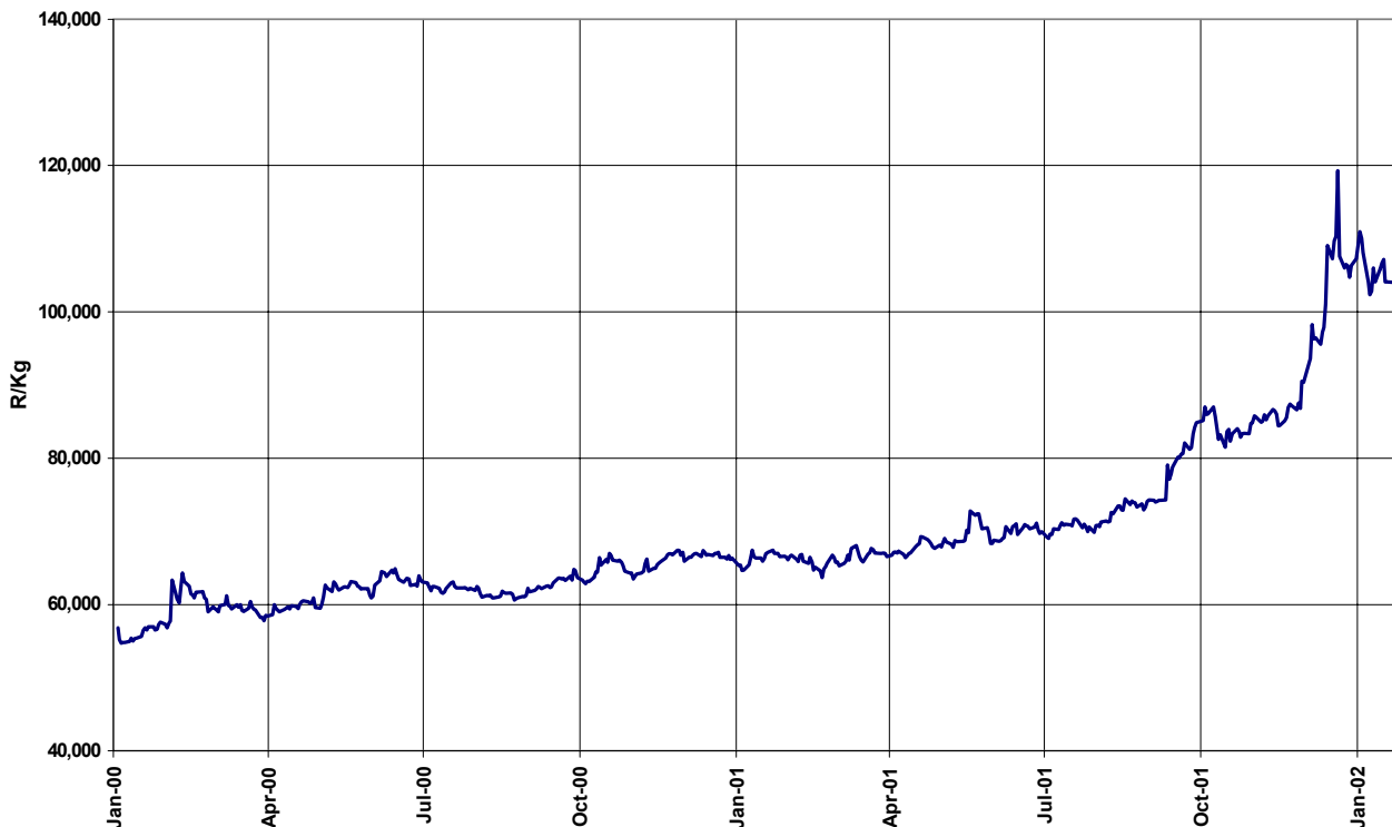
RAND GOLD PRICE: 2000 - TODAY

This fall in the value of the rand has seen the currency break out of all long-term exchange rate relationships with the currencies of South Africa's major trading partners. The currency's average depreciation of some 15% against the US dollar since the early 1990's was broken in September when the rand moved above R8.50 to the dollar, and current exchange rates bear no relationship to any economic fundamentals such as purchasing power parities, cumulative interest rate differentials or inflation rate differentials. This leaves the currency and the associated local gold spot